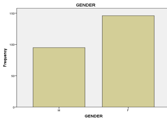
Table 4.1: Gender Distribution of the studied population.